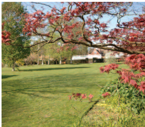
Botanic Gardens, University of Leicester

The Tavistock Institute is a not-for-profit organisation and we try to keep the fees as low as possible. We are grateful to organisations who have supported members' attendance by a donation in previous years – please contact us if your organisation would like to contribute to our Bursary Fund.